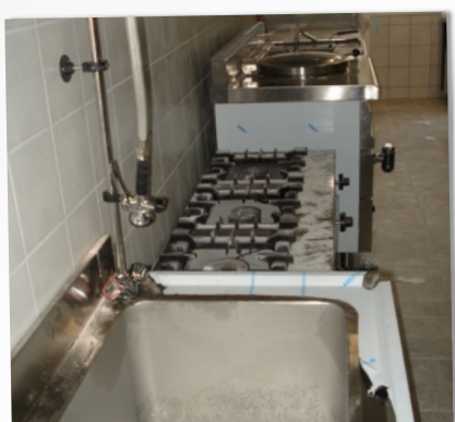
THE NEW KITCHEN