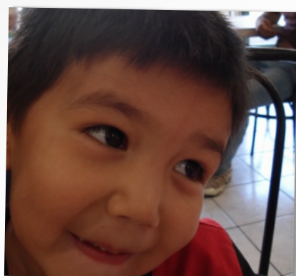
HAPPY TO BE BACK!